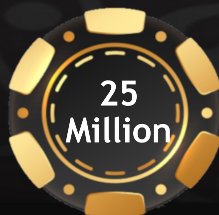
Views of Jamie's Online Clips Annually