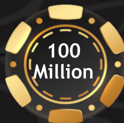
Online Poker Players