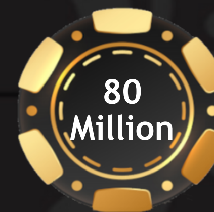
Total Online Views from 2022 WSOP