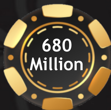
Poker Players Globally