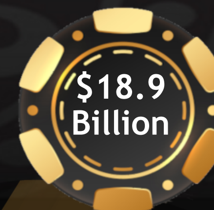
est. Online Poker Market by 2027