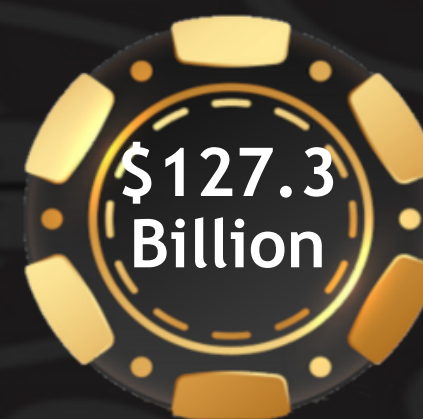
est. Online Gambling Market by 2027