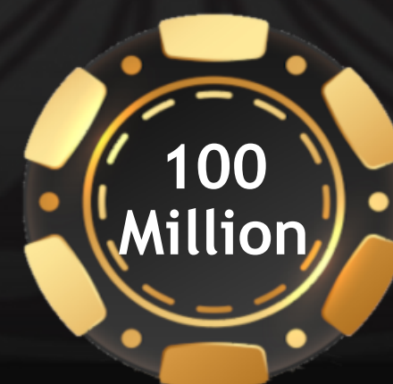
Views Annually from PokerGo YouTube Channel (non- subscriber, free content)